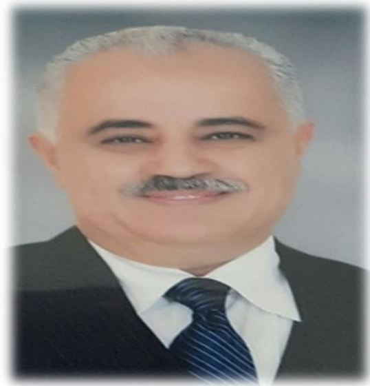
Higher Education, Human Capabilities and Digital Development Senior Consultant

The development of the national economy depends on the educational Palestinian system. Its outputs should meet the needs and the requirements of the labor market. By bringing academia, industry, and technology together, the educational system outputs will be enhanced dramatically. Furthermore, special attention should be given to corporate learning and development programs through providing high quality service in line with the best industry practices and standards using up-to-date technology.