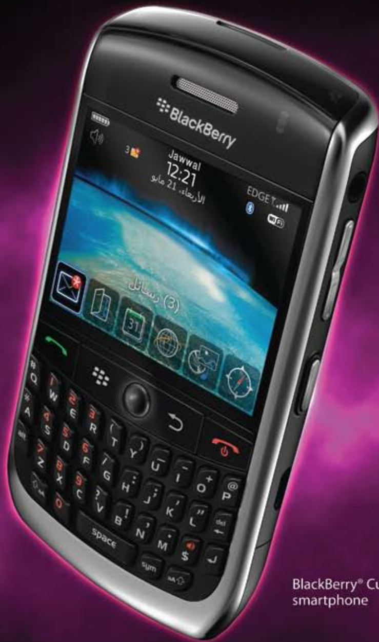
BlackBerry® Curve™ 8900 smartphone

SurePrint™ و SureType® و Research In Motion® و RIM® و BlackBerry® والشعارات ذات الصلة لشركة ريسيرش إن موشن المحدودة وهي شركة وأو مستخدمة في الولايات المتحدة والبرازيل القاري في مختلف أنحاء العالم يتم الاستخدام بموجب ترخيص من شركة ريسيرش إن موشن المحدودة